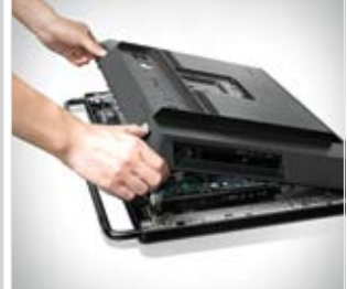
EASY SERVICEABILITY The tool-less chassis offers easy component access for quick servicing and maintenance