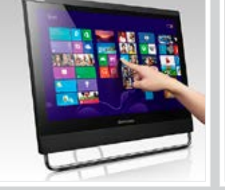
CLEAR AND VIBRANT MULTITOUCH<sup>1</sup> DISPLAY 10-finger touch<sup>1</sup> screen and full HD, anti-glare 23" LED panel