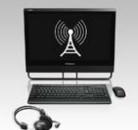
EXCEPTIONAL COMMUNICATION Experience excellent VoIP communication with ThinkVoIP with integrated Microsoft 1080p Lync and Skype™, with Dolby® sound enhancements