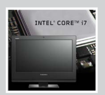
ENHANCED PERFORMANCE Up to Intel® Core™ i7 and desktop-class H81 chipset provides 10% CPU enhancement