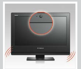
BETTER COLLABORATION Enhanced VoIP experience with optimized 720p HD camera, digital microphone with Noise-Cancelling, and high-quality stereo speakers