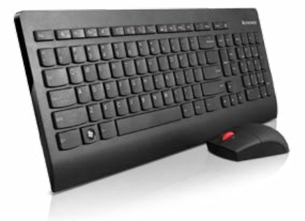
Lenovo® Ultraslim Wireless Keyboard and Mouse combo