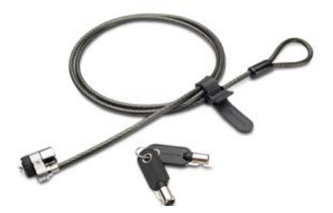
Kensington® MicroSaver Security Cable Lock by Lenovo®

ThinkPad<sup>®</sup> Noise-Cancelling Earbuds