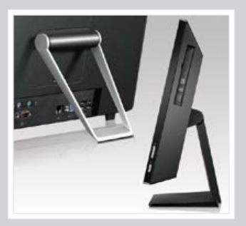
HIGH ON FLEXIBILITY Multiple stand options for flexibility of use in any environment

With superior design and performance, the Lenovo® ThinkCentre® E73z All-in-One (AIO) is the edge that you've been waiting for. Designed to conserve space, the E73z is perfect for small offices, educational instituions, or anyone working in public sector.